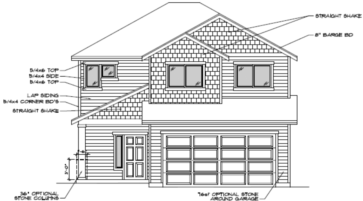
ELEVATION "A" TRIM 1