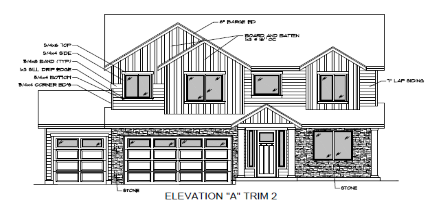
Lot 14 -- Trim package 2

FINAL EXTERIOR DESIGN TO BE CONFIRMED WITH LORENE