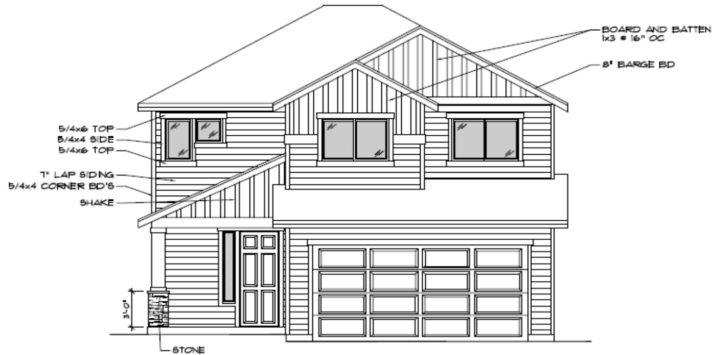
ELEVATION "A" TRIM 2

FINAL EXTERIOR DESIGN TO BE CONFIRMED WITH LORENE